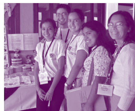
Stewards from the Ambassador Friends Evangelical Church, at Annual Meeting.

Help promote FWCC by wearing a new logo button to the next gathering of Friends you attend. This new version has the colorful Section logo in both English and Spanish. We also have a few T-shirts left with the Section of the Americas logo, made for the annual meeting, size L only. The shirts are 100% cotton, white with colored logo in English. Buttons cost $2 and T-shirts $8 including shipping, and are available from our office.