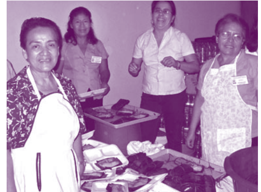
Women from the Ambassador Friends Evangelical Church welcome Annual Meeting participants with tamale supper.

What can be said about the even smaller group of Friends from the Guatemala Monthly Meeting based